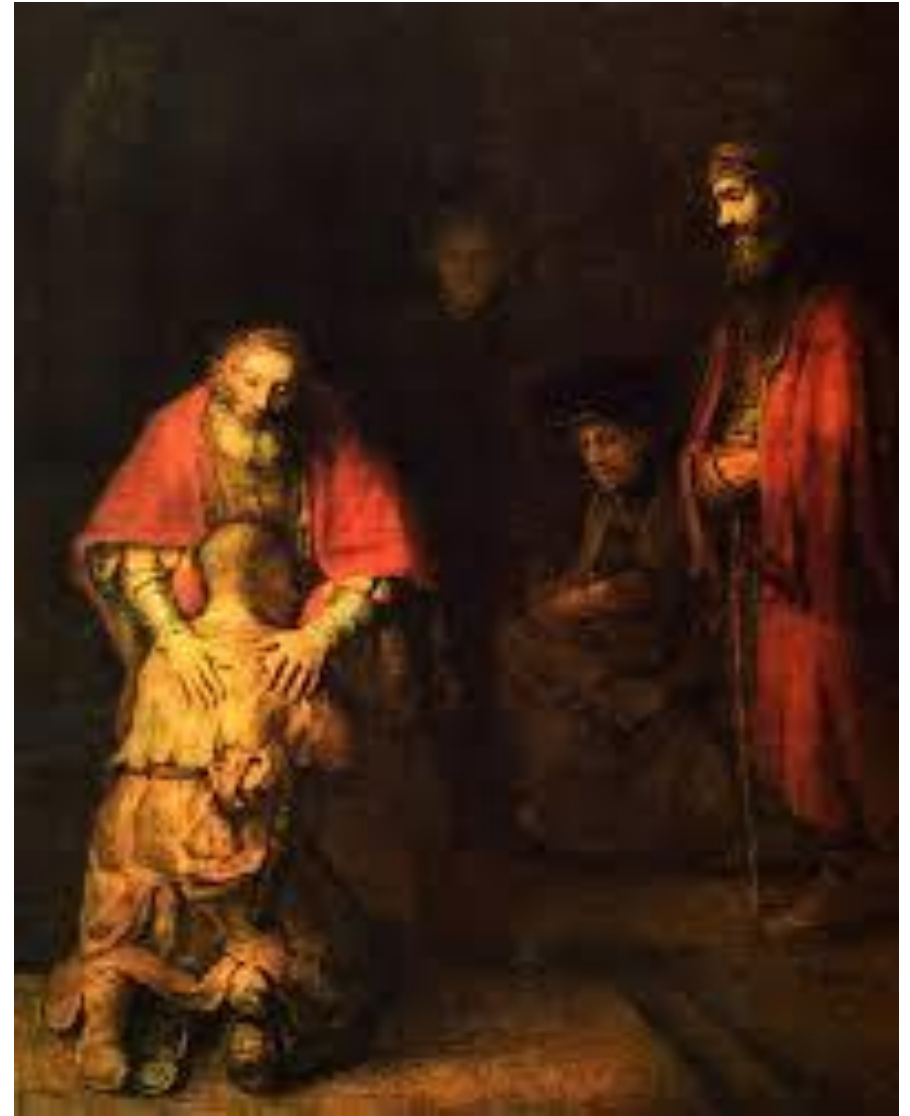
Return of the Prodigal, by Rembrandt Van Ryn