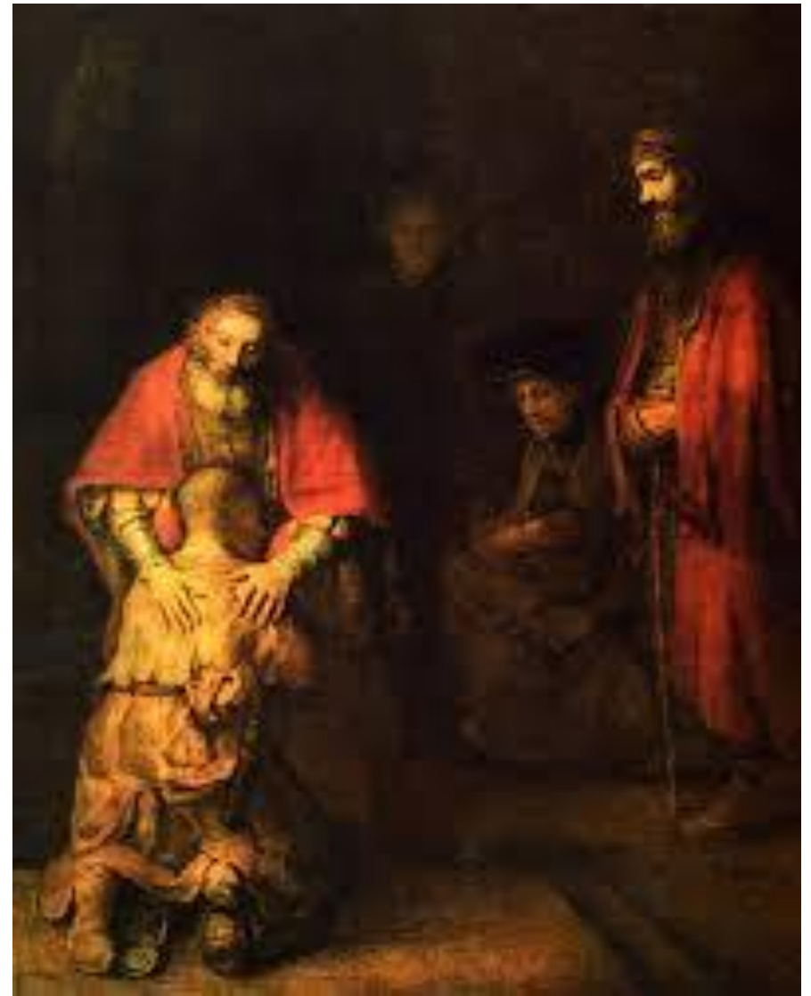
Return of the Prodigal, by Rembrandt Van Ryn