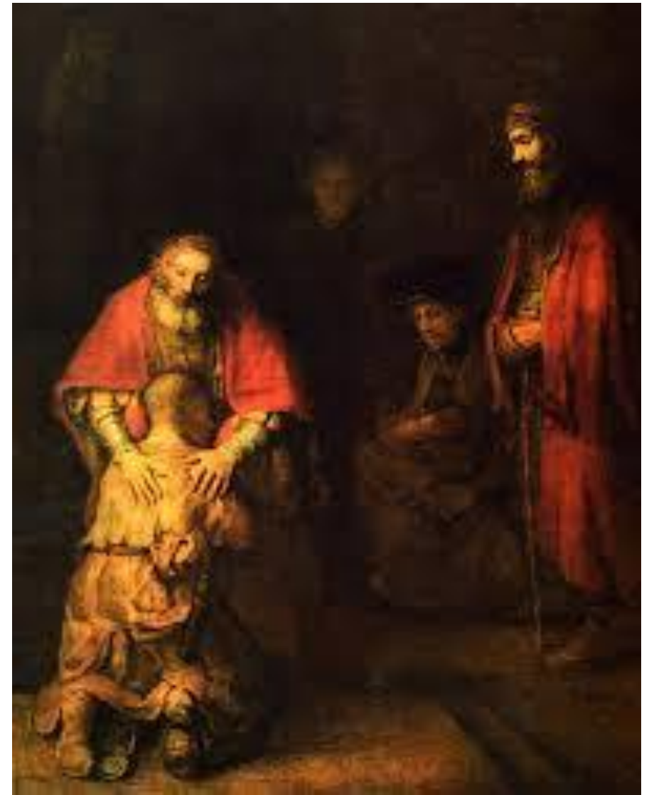
Return of the Prodigal, by Rembrandt Van Rijn